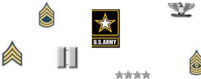
VETERANS BENEFITS ADMINISTRATION