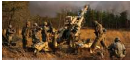
VETERANS BENEFITS ADMINISTRATION

O Commissioned Officer A commissioned officer’s primary function is to provide management and leadership in his or her area of responsibility.